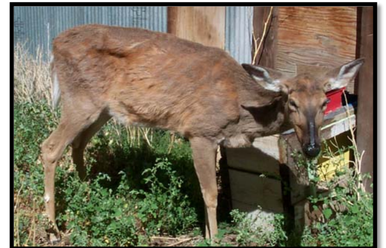
Elk with CWD