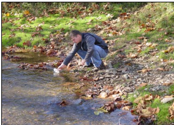
Figure 3. Taking a water sample for analysis.

Some chemical compounds and heavy metals have been shown to suppress the immune system of certain aquatic organisms. These contaminants are referred to as “endocrine disruptors”. Natural and synthetic forms of the hormone estrogen also fit into this category. Estrogenic activity was measured in water samples taken throughout the Shenandoah River and its tributaries at levels that could cause biological effects in fish. However, at this time there has been no definitive or conclusive evidence that chemicals are negatively affecting the immune system of fish in the Shenandoah or James River and contributing to the mortality/disease events. Researchers with the United States Geological Survey (USGS) are still actively engaged in understanding how certain contaminants may influence the immune system of fish. This research includes fish taken from Virginia rivers as well as other rivers in the Chesapeake Bay Watershed. The Virginia Department of Game and Inland Fisheries (DGIF) continues to work with these scientists by providing fish samples.