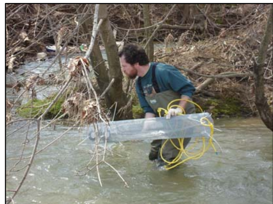
Figure 4. Placing a passive chemical sampler in the river.

Fish health investigations to date have included: histopathology (Figure 6), parasitology, bacteriology, virology, and blood analysis (Figure 5). This information has been collected from the affected rivers, over multiple years, and also from “reference” rivers where these mortality/disease events have not been occurring. Fish health samples have been analyzed by several Universities, the United States Fish and Wildlife Service’s Northeast Fish Health Lab, and the United States Geological Society’s Eastern Fish Health Lab. While researchers have collected a plethora of fish health data, linking the disease and mortality episodes to a single cause has been elusive. Some research findings are described in the Virginia Tech University final report “Investigation into Smallmouth Bass Mortality in Virginia’s Rivers” (Orth et al. 2009) and can be found on the DGIF website www.dgif.virginia.gov/fishing/fish-kill/