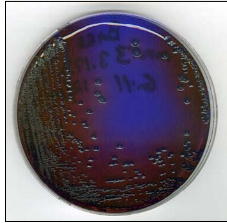
Figure 8. Culture of Aeromonas salmonicida .