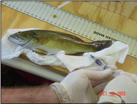
Figure 5. Taking a blood sample from a live adult smallmouth bass.