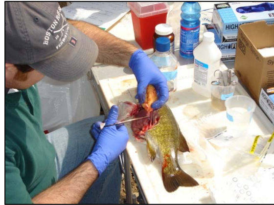
Figure 6. Collecting histopathology samples from a smallmouth bass.

Researchers looked to aquatic insects as a possible way to understand the cause of the problem in the Shenandoah River Watershed. The Entomology Department at Virginia Tech was contracted by DGIF in 2006 to conduct a comprehensive evaluation of the aquatic macroinvertebrates in the Shenandoah River Watershed. Unfortunately, the study did not detect the cause of the fish mortality and disease problems. However, the main finding was that the Shenandoah River's aquatic insect community is indicative of an agricultural based watershed, is more vibrant than the New River in Virginia and the Susquehanna River in Pennsylvania, and is more diverse and healthy than it was back in the 1960's. Virginia Tech's final macroinvertebrate report can be viewed on the website www.dgif.virginia.gov/fishing/fish-kill/