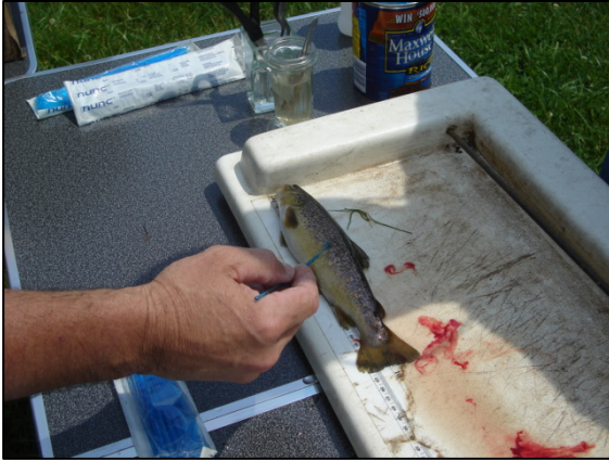
Figure 7. Swabbing fish for bacteria.

throughout the river, the number of potential reservoirs, and how much river (distance) can be affected by a single reservoir of bacteria. Additional questions that researchers hope to answer concerning this bacteria include: 1) What is the spatial distribution of the disease in these rivers? 2) Why are certain species of fish more susceptible to the disease than others? 3) What is the main vector of disease transmission (fish to fish contact or through water/fish contact)? 4) Why is disease not as prominent in juvenile fish as it is in adults? 5) Are fish becoming more resistant to the bacteria over time? 6) Do certain environmental parameters influence the virulence of the bacteria? 7) What is the average percentage of smallmouth bass and sunfish (throughout the river) that are carrying the bacteria and becoming diseased?