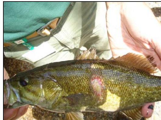
Figure 2. Adult smallmouth bass with lesion.

From the research and monitoring conducted to date, there has not been any conclusive evidence that water quality variables or chemical contaminants were directly responsible for these fish mortality/morbidity events. Contaminant levels were measured in the rivers affected as well as some rivers where these fish mortality/disease events were not occurring. Contaminant levels were measured at both base-flow and during runoff events (Figure 3). Passive chemical samplers were deployed to absorb chemicals just as a fish would over a given period of time in the river (Figure 4). However it must be noted that not every possible chemical compound was measured, and that the toxic concentration of