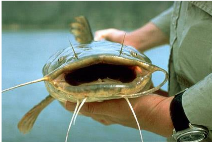
Flathead catfish are a large native predatory fish found in the New River.