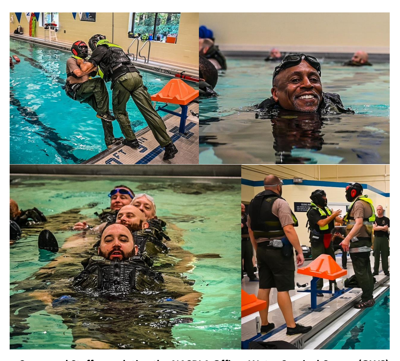
Command Staff completing the NASBLA Officer Water Survival Course (OWS)