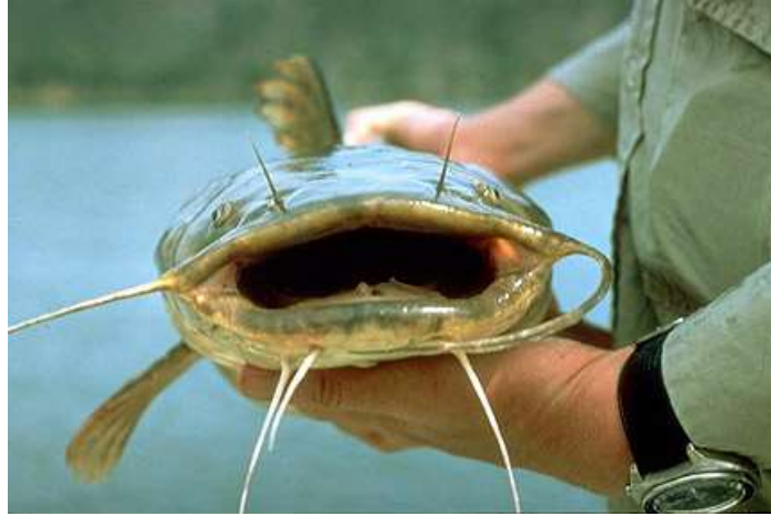
Flathead catfish are a large native predatory fish found in the New River.