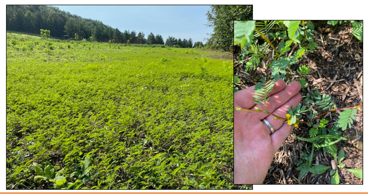
Partridge pea that showed up for free after burning

For those that are past the first year of implementation you have likely realized nothing is one and done. Everything we do to manipulate the land requires maintenance and upkeep. Since we know nothing is static, we understand and plan for future manipulation. Take the hurdles as they arise and just incorporate them in your future maintenance instead of allowing them to prevent you from beginning. What is important is that you take that first bite.