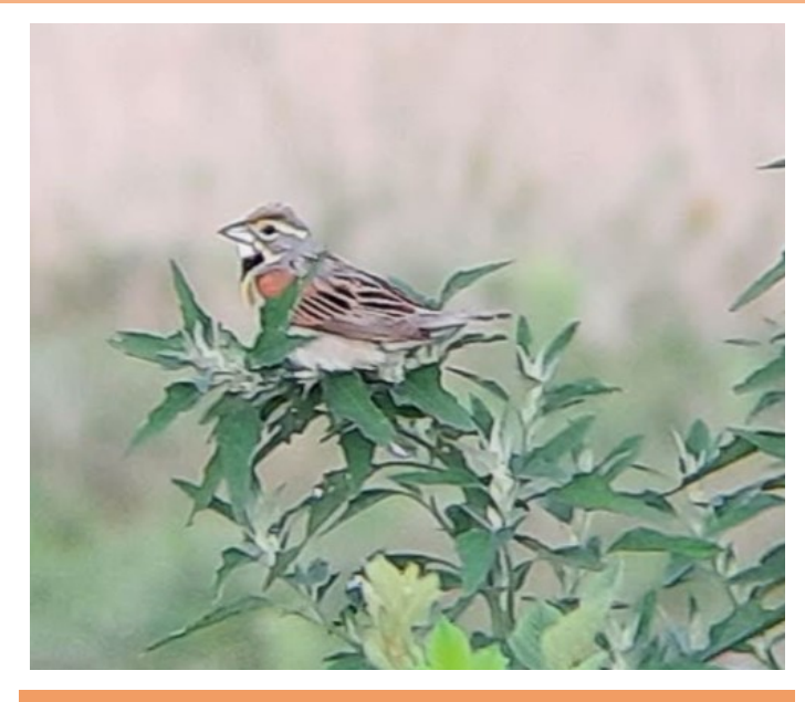
Dickcissel perched on Lambs quarter plant.

My last day as a PLB is (was) November 4th. But if history continues to repeat itself, I may be back! I was here in 2010, and again in 2022, so you never know. For some crazy reason, these quail people still like me. I'll leave you with one of my highlights from this past year. I am not a landowner,