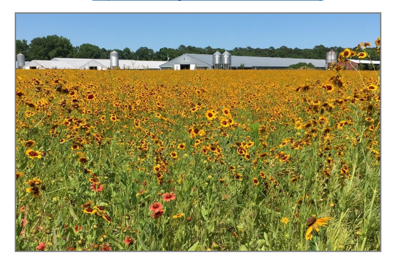
Pollinator habitat in Accomack County, Virginia

No one had heard or seen Bobwhites around here in years, but I heard them singing in that field on two occasions this summer! It just goes to show how valuable fallow fields and 'waste' areas prove to be when left alone. Allowing a few thicket 'islands' in your pastures and hay fields can make a big difference to many critters. My neighbor had to mow the field in August to prepare for winter stockpiling, but I know they will plan to allow it to grow late into the summer next year as well. If you have any fallow fields that you don't need for pasture or hay, consider only mowing or disking them once every 2-3 years, and timing your mowing for February or March to allow the tall vegetation to provide cover and food all winter. Of course, doing a full conversion to remove the thick cool season grasses and replace them with native grasses and wildflowers is a boon for many wildlife, especially because of the enhanced open structure at ground level. But simply mowing less often and allowing a few thickets to grow up is better than a clean-mowed field. And just look at the list of bird species below to get a glimpse of who benefits from this form of management! (Link to bird list for 7/19/22: https://ebird.org/checklist/S115404185 ).