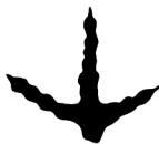
TURKEY H - 4" F - 4"