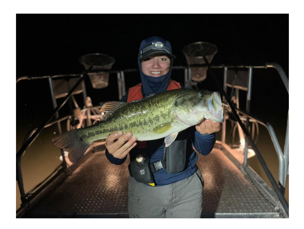
Region 4 (Northcentral/Northwestern)