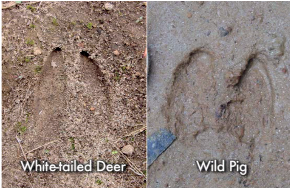
The track of a whitetail deer and a wild pig is similar. However, with a closer look the hoof print of the pig is a dead give away.

makes sense or saves the day like trucking your horses, dogs, UTVs, and a camera crew down the interstate to capture one nasty boar with a nickname that has just been wreaking havoc on a rancher's fences. I heard he had 4-inch tusks, weighed 750 pounds, and once ate a rusty Volkswagen Beetle in the back pasture! The show may conclude something like this... "No problem sir, it was a long and hot day, but we got that boar...he won't be messin' up your fences anymore. Load those horses and dogs, then get that hog on the truck...our work here is done." Did you catch the part earlier where I said they reproduce like rabbits? Maybe there aren't any other hogs around and this was the only one there? Maybe they'll have a crew search for more hogs after the filming stops? Nonsense. All the while we watched the excitement from our couches and couldn't help but think it looked fun. Where can I go do that? I sure would like to hunt these pesky hogs to try to wipe them out. Let me search around and see where we have hogs. Whew, that fire is really cooking now... let's wait a while before we throw another log on.