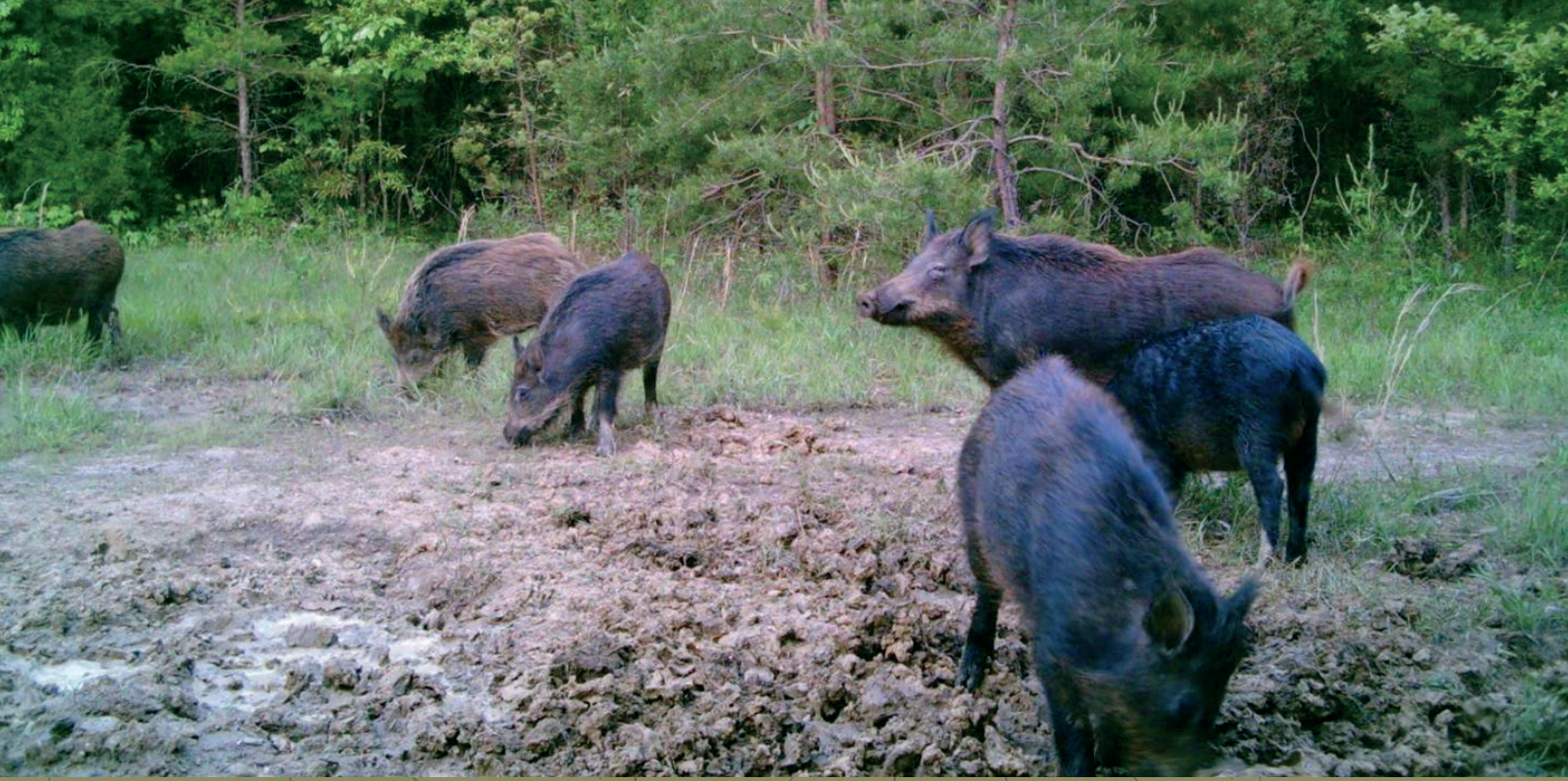
The feral hog populations continue to grow and become more widespread. Controlling this nuisance species to prevent habitat devastation along with diseases that can infect pets, livestock, humans and other wildlife species has become a priority with game and fish agencies throughout the country. This trail camera photo taken in Culpeper County clearly shows the damage done by a group of feral hogs to a wildlife food plot.

wild, phone calls to state wildlife agencies were most likely handled in this manner: (1) they're not a game animal; (2) nobody has claim to them as a livestock animal; so (3) we'll call it a nuisance species— go ahead and try to control them year-round. As traditional deer hunters began to harvest these tough and rugged feral animals, a light bulb flickered on. You mean to tell me that these things are tasty, a nuisance animal with a year-round open season, and they are fun to shoot?! Throw a log on that flame... better make it two.